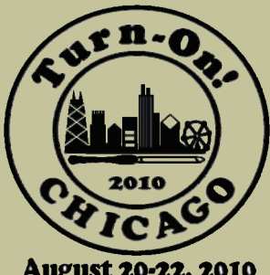
August 20-22, 2010 Mundelein, IL

The Conference Center at the University of Saint Mary of the Lake is located on 900+ wooded acres in Mundelein, IL. Just a few minutes north into Lake County, USML is a secluded, quiet escape from the hustle of the city. Everything is provided on-site, including all meals, and even snacks. Once you arrive, you can leave your wallet in your pocket, as everything is included. Housing in the Residence Hall is available as well.