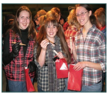
Small gifts bring big smiles

giving the room a festive touch with her decorating. Hard work and dedication, indeed.