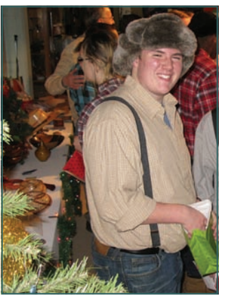
Jazz member seems happy to be here!

A highlight was the return of Indigo Jazz, the elite, all-volunteer vocal group from Palatine High School. Decked out in traditional "lumberjack" garb (where did they find