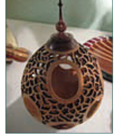
Pierced vessel on the table at the December meeting