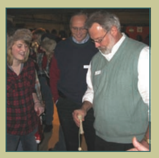
Well, one more try