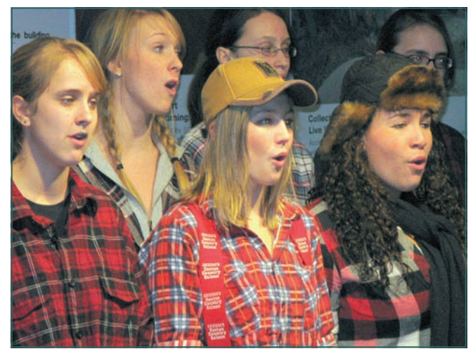
When in doubt, run a picture of pretty girls. That's the first rule of newsletter editing. See the January 2007 Issue for proof