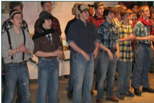
All together now, Indigo Jazz entertains