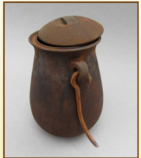
Week of December 26