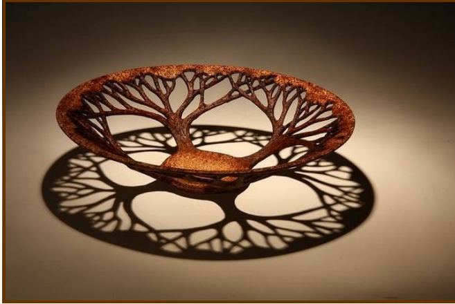
Week of December 5