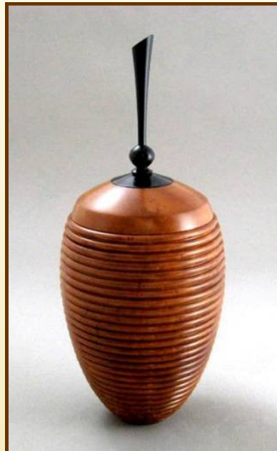
Week of December 12 Madrone