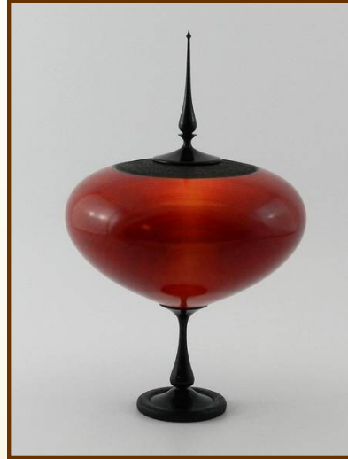
Week of December 19 Ash