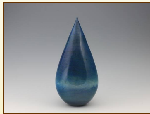
Week of December 10