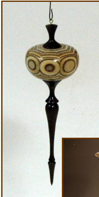
Week of December 3