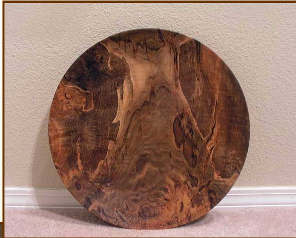
Week of Dec 17