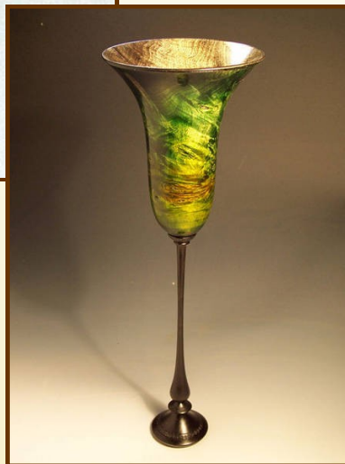
Week of December 10