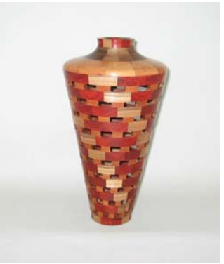
Duard Oxford Segmented Vase