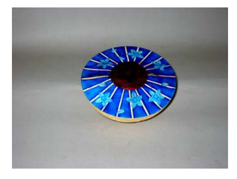
Josh Connan Charred Air Brushed Vessel