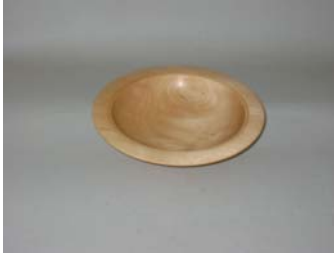
Bill Brown Birch Bowl