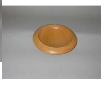
Bill Brown Maple Bowl