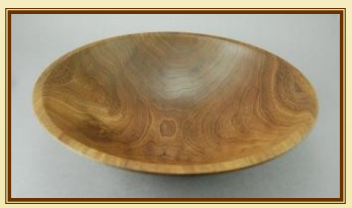
Dick Sing - Walnut