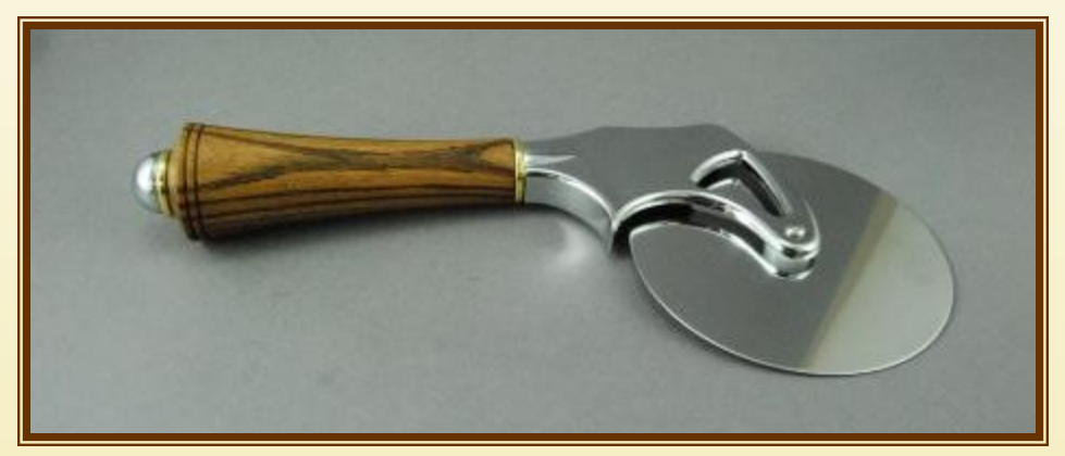
Ken Staggs - Zebrawood