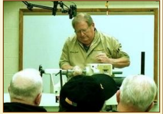
Sanding and Finishing

"Why turn wooden eggs?" you may ask. Aside from the family heirlooms you can pull out each Easter, they have practical applications. Dick grew up on a farm that had 500 laying hens. That's enough to fill a 5-gallon bucket with eggs, twice a day. And farmers know that a hen will sit on a nest so long as it contains at least one egg. But if the eggs all hatch, the hens will move on to build another nest. But if you keep a wooden egg in the nest, the hens won't abandon the original nest.