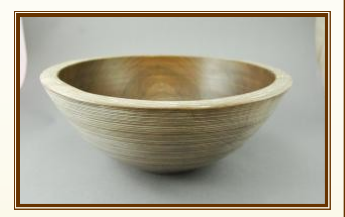
Dave Neybert - Walnut/Milk Paint