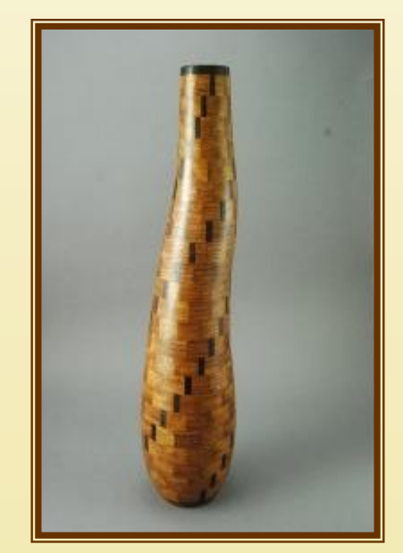
Al Miotke - Jatoba/Wenge