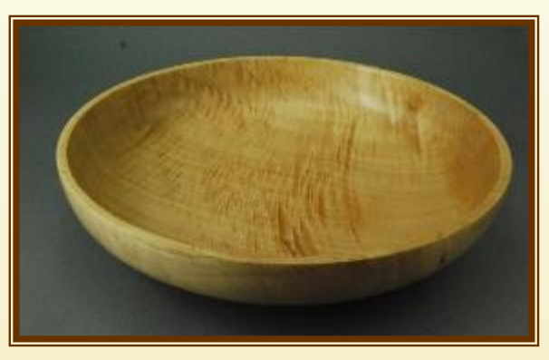
Dwaine Hitpas - Maple