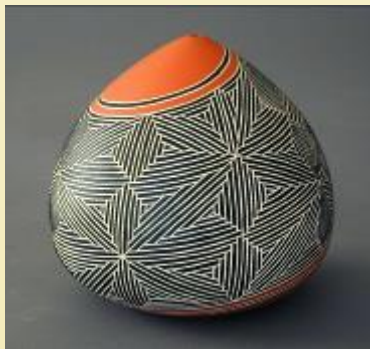
Clay Foster - Fine Line

Come on out and see the best in Woodturning.