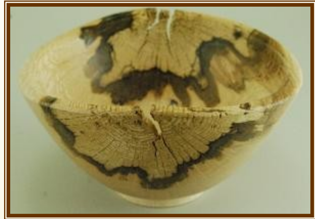
Larry Fabian - Maple