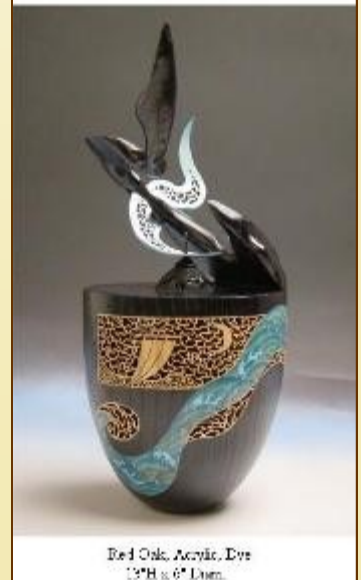
Red Oak, Acrylic, Dye 13" H x 6" Diam.