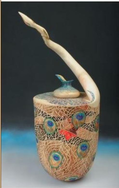
Box Elder, Acrylic and Gold Leaf 21" H x 8 1/4" Diam.

Our own member Bihn Pho needs no introduction. The following is from his website.