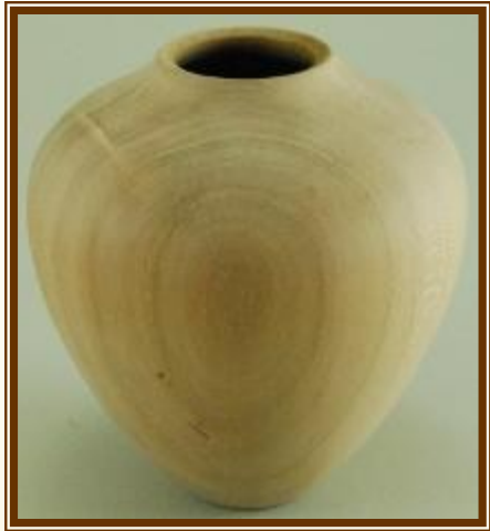
Lars Stole - Cherry