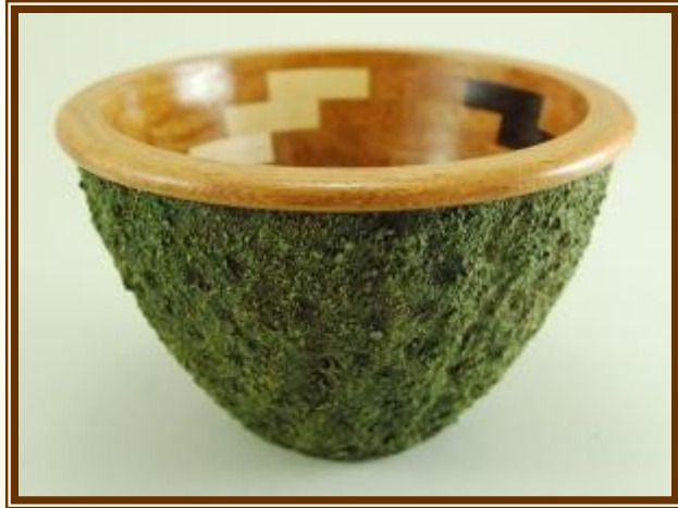
Al Moitke Vase - Maple