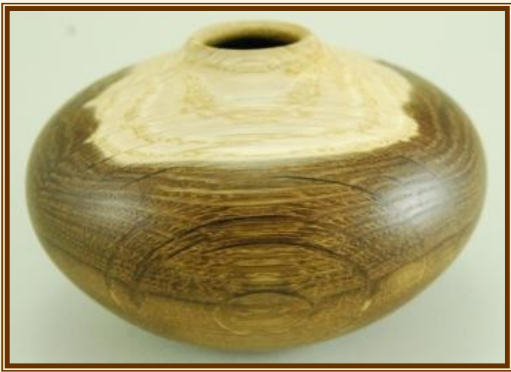
Lars Stole - Oak