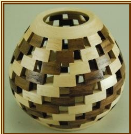
Jerry Kuffel - Walnut