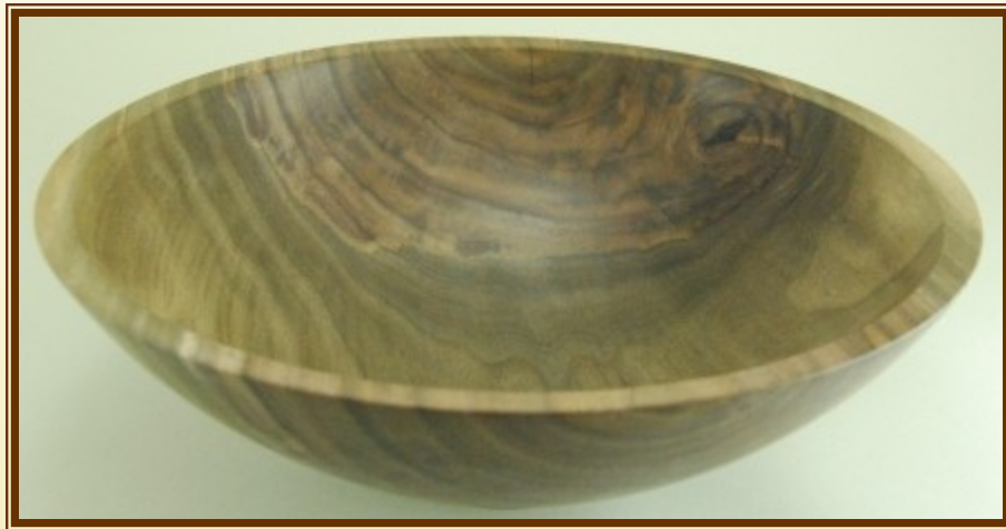
Roberto Ferrer - Walnut