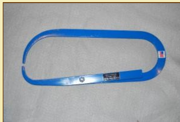
L&R Haverstock Deep Hollowing Calipers.

Maybe you have seen all of these demonstrators before and have mastered all of the skills and techniques that they have to offer. If not, seeing them a second time is sure to add to your understanding. It usually takes a couple of repetitions for things to sink in for most of us anyway. Besides, all of your turning buddies will be there. You may even have a new set of L&R calipers for your efforts. So stop procrastinating and register by May 20 th . We'll see you this August in Mundelein!