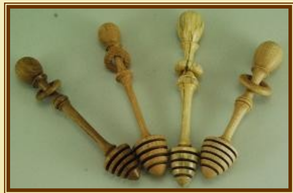
Ken Staggs - Various