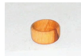
Duard Oxford Buckthorn Ring