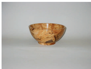
Ken Staggs Walnut Bowl