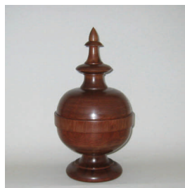
David Bray Walnut Finial