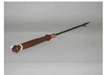
Bill Brown Walnut Handle Fireplace Poker