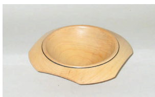
Duard Oxford Maple Bowl