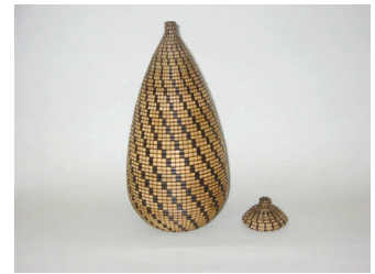
Fred Gscheidle Popular Illusion Vessel Alt Tops