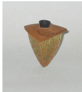
Pixie Eslinger Cherry Box Elder Acrylic Box