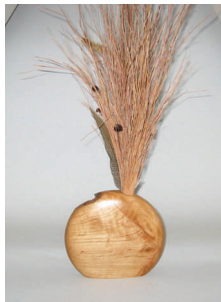
Rich Fitch Prairie Grass Vase