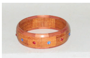
Duard Oxford Rosewood Bracelet