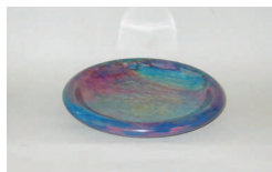
Paul Shotla Dyed Maple Platter