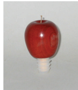
Grant Barlow Bloodwood Bottle Stopper