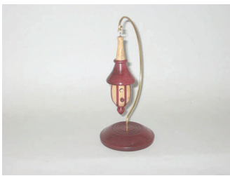
Bill Robb Purpleheart /Maple Birdhouse Ornament