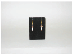
Ken Staggs Miniature Earrings