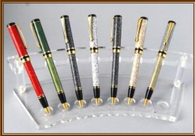
Paul Pyrcik Acrylic Pens