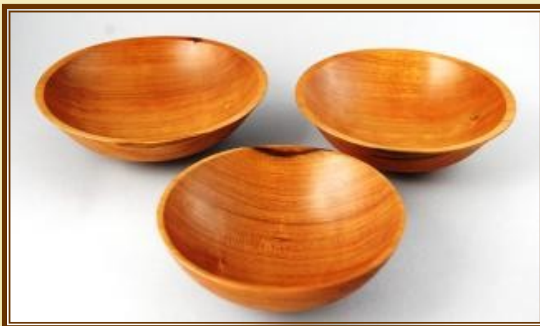
Bill Brown Cherry