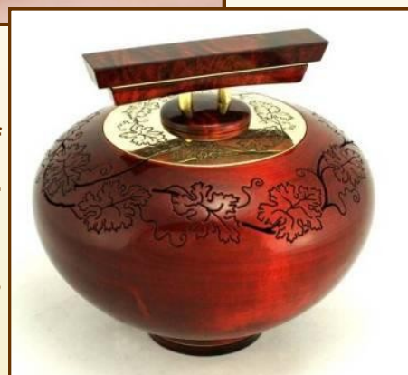
Week of May 24 Maple, Brass