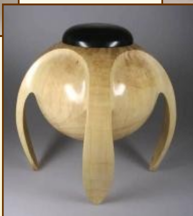
Week of May 17 Maple, Ebony