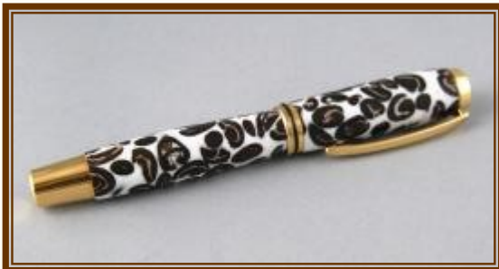
Jim Wickersham Coffee Bean Pen