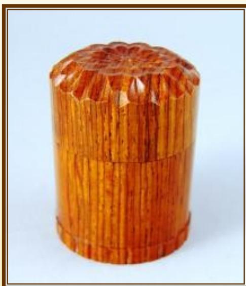
Roy Lindley OT Threaded Box Cocobolo