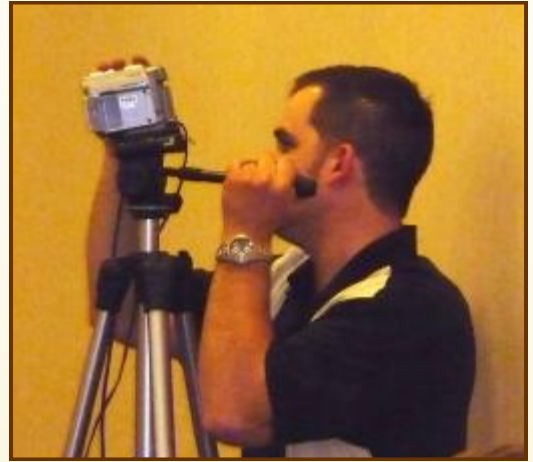
Would you like to buy the DVD?