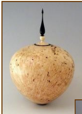
Week of May 3 Maple Burl