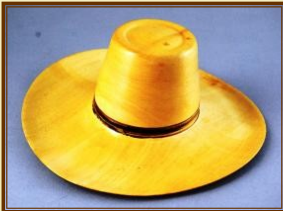
Darrell Radar Miniature Hat Box Elder