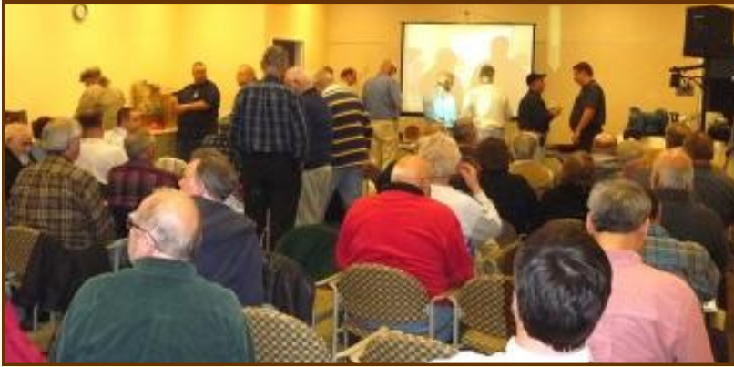
Let the Games Begin!