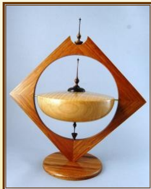
Alan Carter Figure Maple, Jatoba, Rosewood