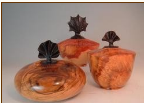
Week of May 10 Apricot, Carob Blackwood