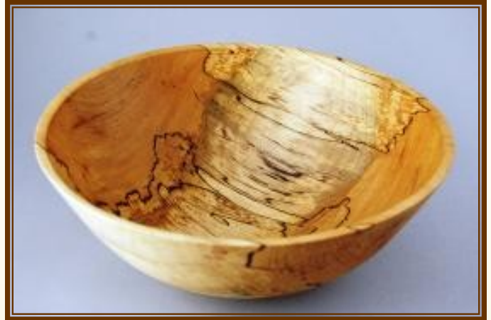
Bill Brown Spalted Maple