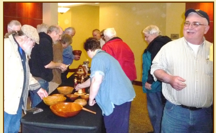
This is so much fun.