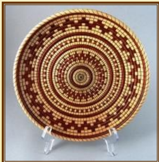
Fred Gscheidle Basket Illusion