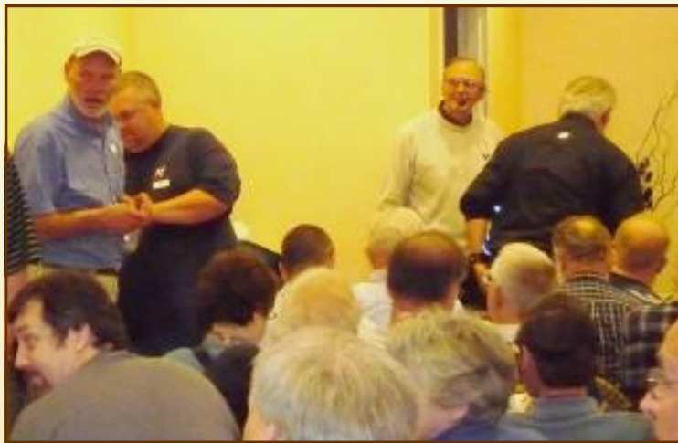
Come-on! Somebody has the ticket for this walnut log