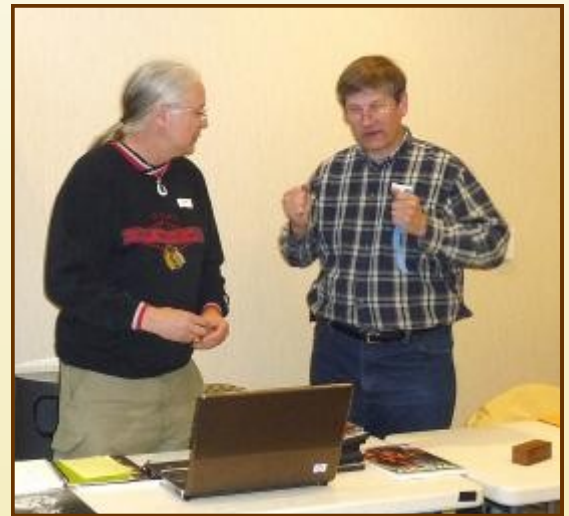
Darn, I wanted that Log!