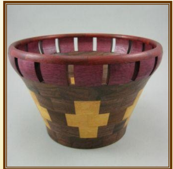
Tom Boerjan—Walnut, Yellowheart, Purpleheart