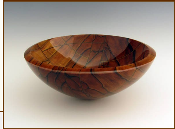
Week of May 20