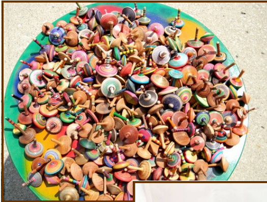
Week of May 6 Tops for kids in Kenya