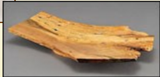
Week of May 27