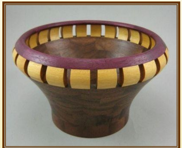
Tom Boerjan –Walnut, yellowheart, Purpleheart