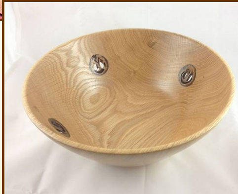
Week of May 13