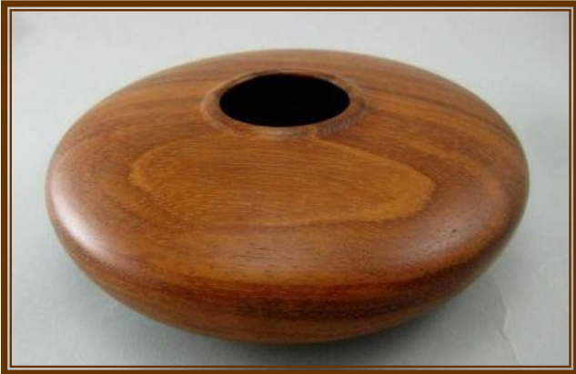
Dan Bunce –Koa