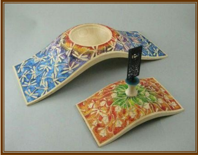
Binh Pho-Jimmy Clewes Collaboration