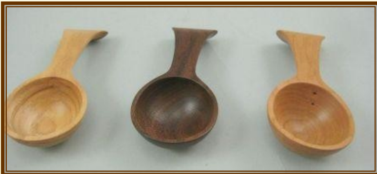
Dave Nybert—Cherry, Walnut, Hickory