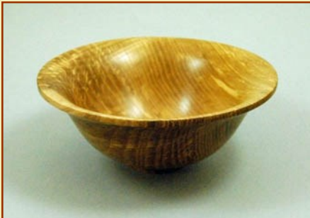
Rich Nye Ash