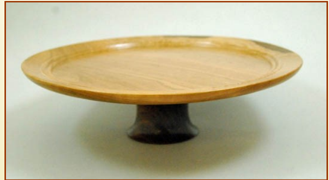
Jack Harkins Cherry, Walnut