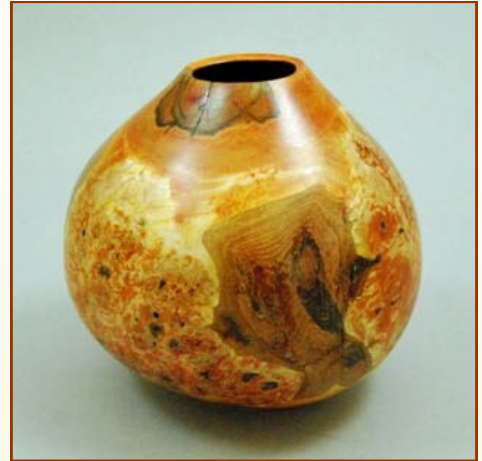
Rich Nye Birch