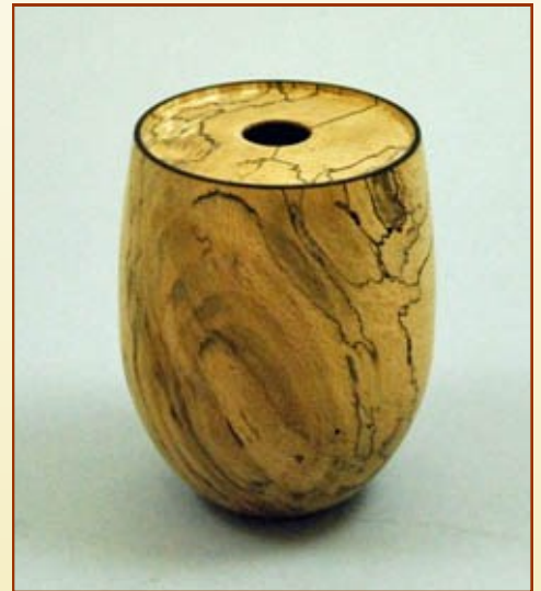
Rich Nye Birch