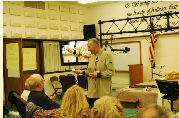
Meeting adjourned at 9:35