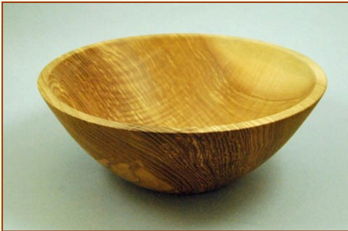
Rich Nye Ash