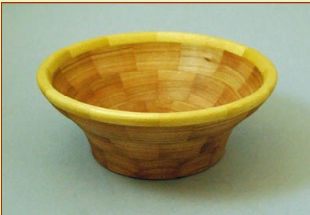
Tom Boerjan Empty Bowls Donation