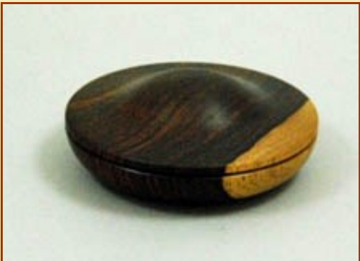
Rich Nye Cocobolo