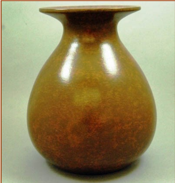
Dan Gascoigne Birch