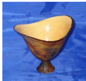
Chuck Young Ash Vessel Wood burned and Charred