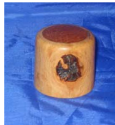
Don McCloskey Maple/ Lace wood Paperweight