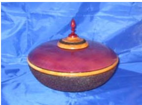
Jerry Sergeant Threaded Top Maple Urn