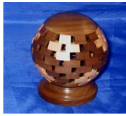
Bill Robb Walnut Maple Open Segment Ornament