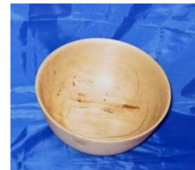
Ken Staggs Spalted Maple Bowl