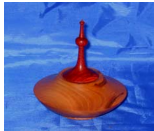
Ken Staggs Cherry Paduca Box