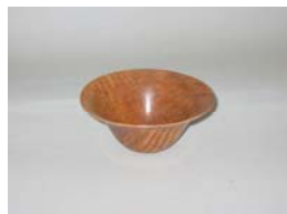
Chuck Young Eucalyptus Bowl