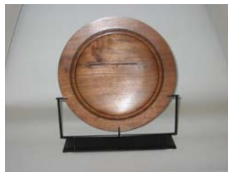
Bill Brown Walnut Platter