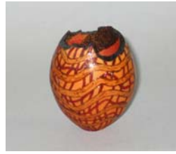
Josh Connan Airbrushed Woodburned Maple Vessel