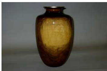
Steve Sinner Walnut Vessel Square Pattern