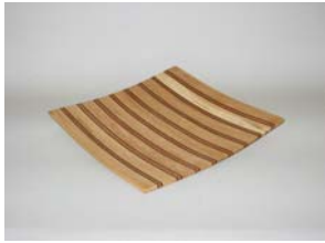
Francisco Bauer Oak Blackwood Mahogany Square Edge Bowl