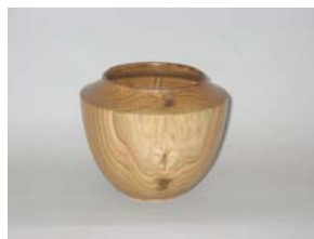
Dick Sing Butternut Vase