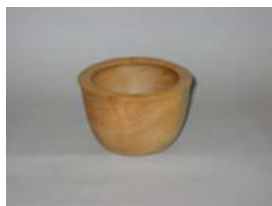
Ken Staggs Soft Maple Bowl