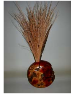
Rich Fitch Prairie Grass Manzanita Burl Weed Pot