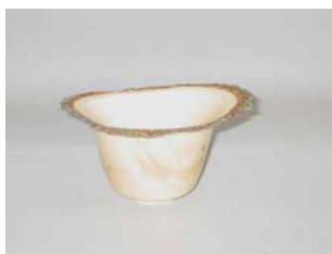
Clint Stevens Box Elder Natural Edge Bowl