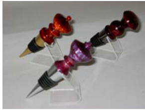
Phil Brooks 1st Acrylic Bottle Stoppers