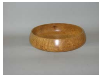
Dick Sing Spalted Maple Utility Bowl