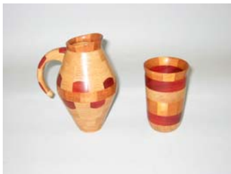
Duard Oxford Segmented White Oak Bloodwood Mahogany Pitcher and Cup