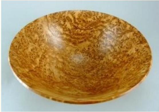
Dick Sing Black Oak Burl