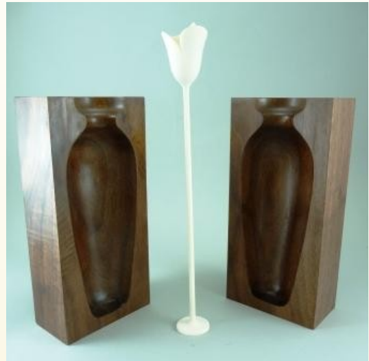
Lars Sole Walnut, Holly