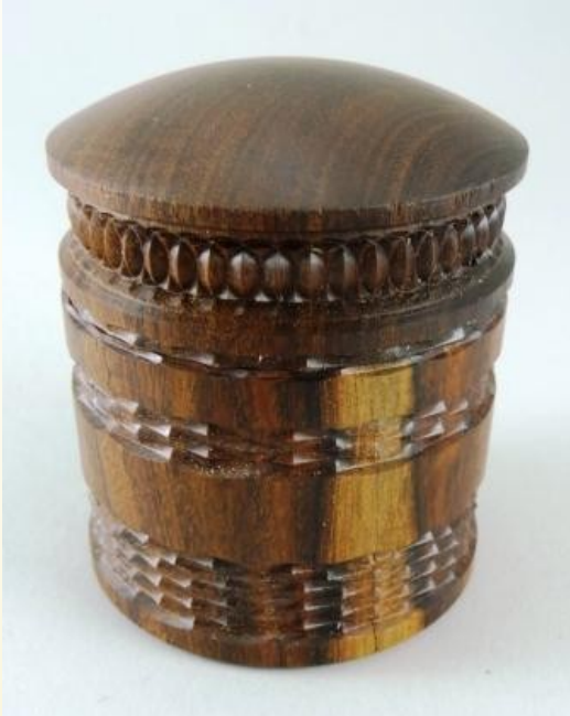
Rich Nye Leadwood