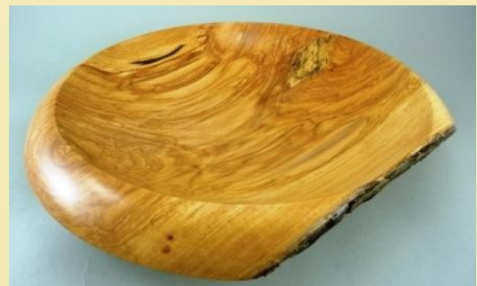
Ken Staggs Maple