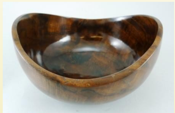
Phil Brooks Figured Walnut