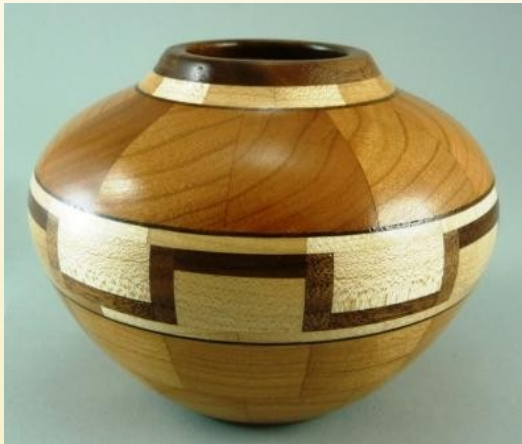
Al Miotke Cherry, Maple, Walnut