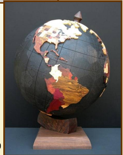
Week of July 30