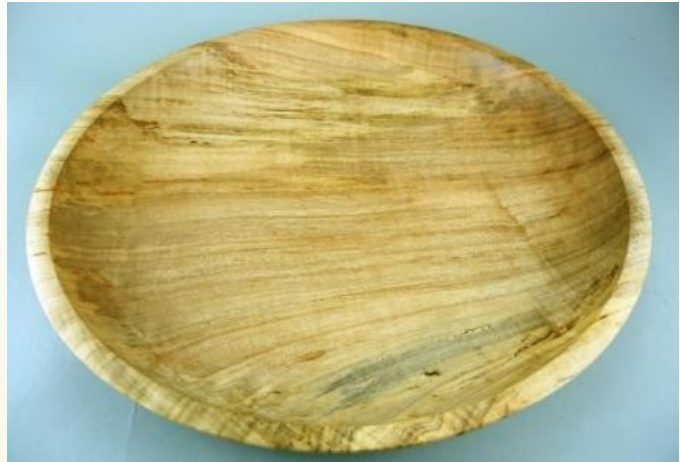
Bill Brown Maple