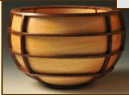
Week of June 16 Maple, Walnut