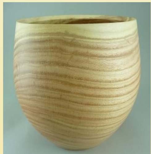
Unknown Honey Locust