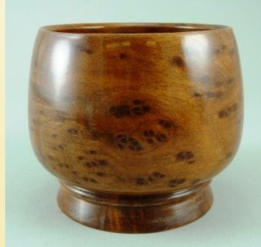
Phil Brooks Redwood Burl