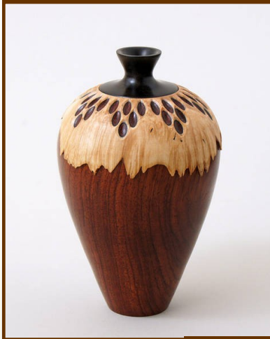
Week of July 2 Maple, Bubinga