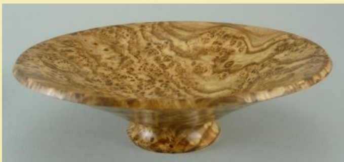
Dick Sing Black Oak Burl