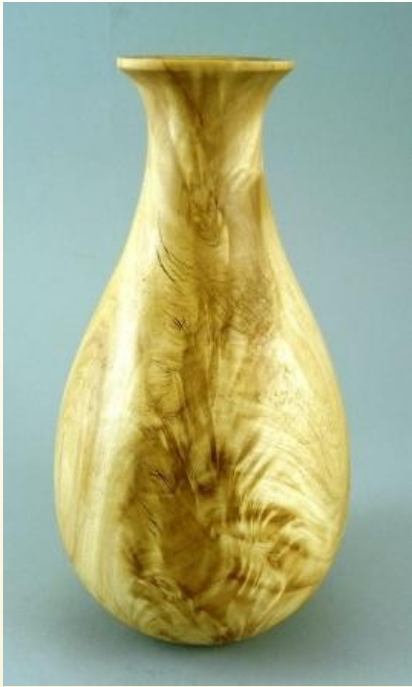
Rich Nye Cottonwood