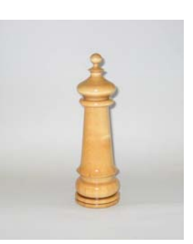
David Bray Maple Pepper Grinder