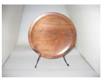
Bill Brown Walnut Platter