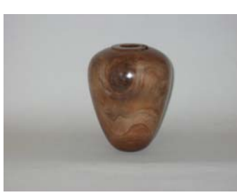
John Eslinger Black Walnut Vase