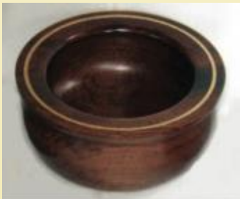
Figure 3. A walnut bowl with an undercut rim and gold leaf on the rim.