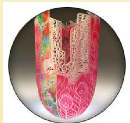
Heaven Can Wait