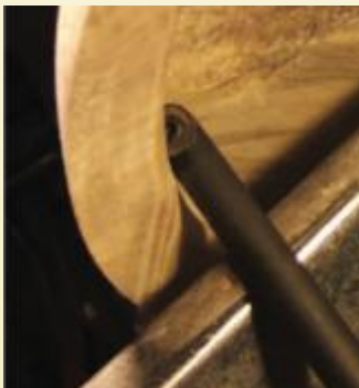
Figure 2. Undercutting the rim with the 3/8" Hunter Carbide Tool.

Figure 3 shows a walnut bowl with undercut rim. The wide rim allowed cutting two grooves and filling the center with gold leafing. Unfortunately, this bowl looks like a chamber pot for midgets, but that's life.