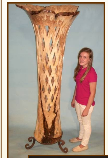
Week of September 9—Ambrosia Maple