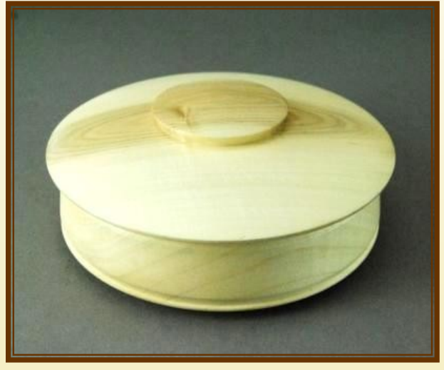
Ken Staggs—Silver Maple