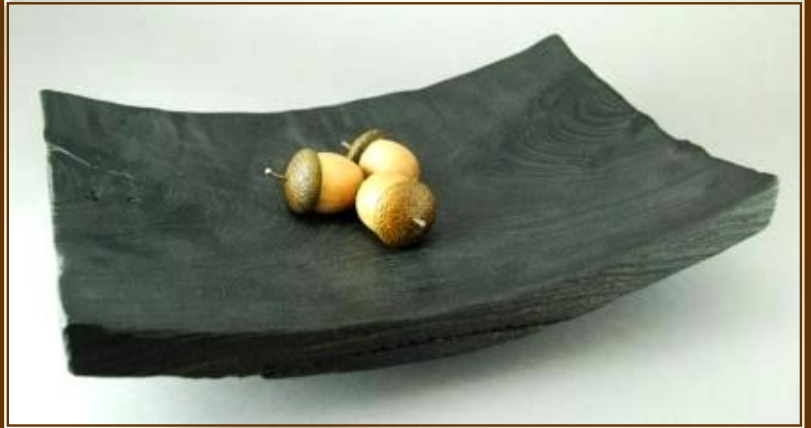
Al Miotke—Oak, Maple