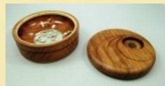
Larry Fabian - Bubunga