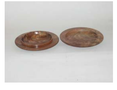
Lloyd Beckman Walnut Box Open