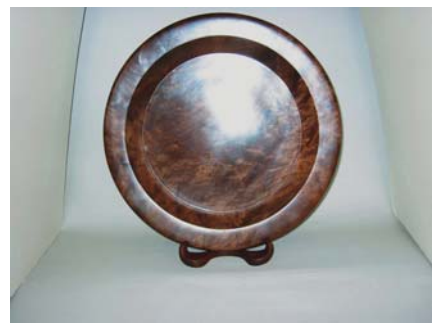
Lloyd Beckman Walnut Platter