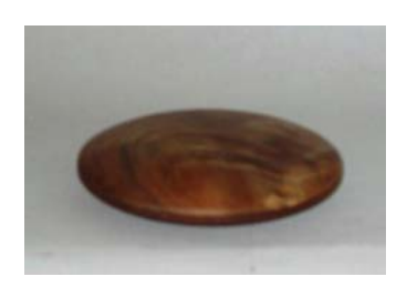
Lloyd Beckman Walnut Box Closed