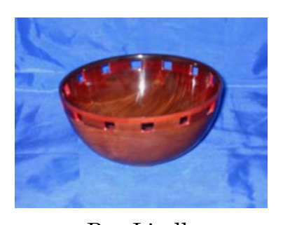
Roy Lindley Airbrushed Bowl