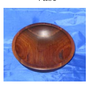
Ken Staggs Walnut Bowl