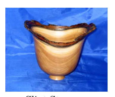
\begin{array}{c} {\rm Clint\ Stevens} \\ {\rm Natural\ Edge\ Walnut} \\ {\rm Vase} \end{array}