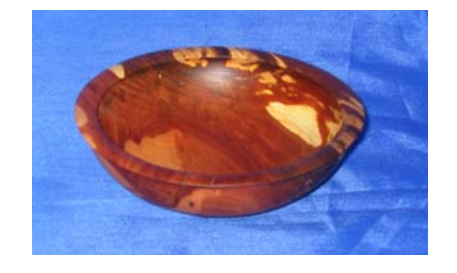
Ken Staggs Applewood Bowl