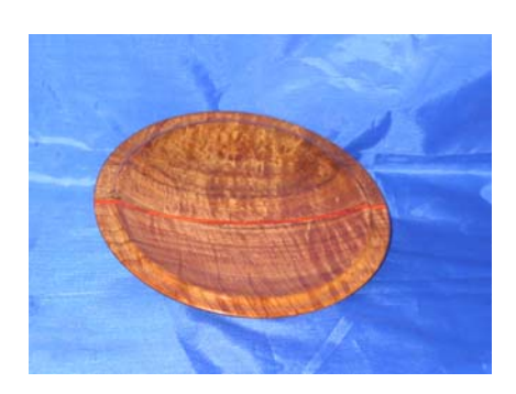
Hugh Pearl Figured Koa & Paduak Platter