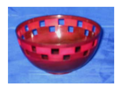
Roy Lindley Airbrushed Bowl