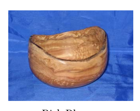
Dick Dlugo Natural Edge Crabapple Bowl