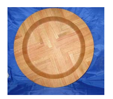
Francisco Bauer Red Oak Platter