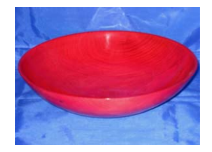
Roy Lindley Airbrushed Bowl