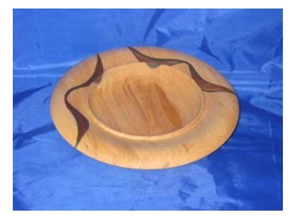
Dave Buchholz Maple, Walnut & Epoxy Platter