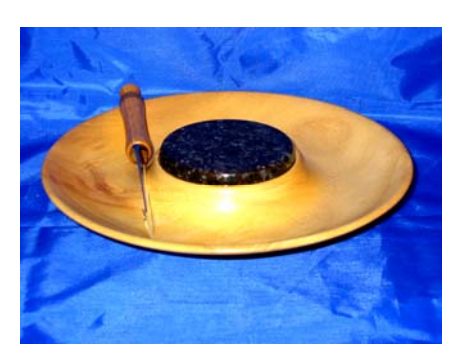
Hugh Pearl Oregon Myrtle Cheese Board & Knife