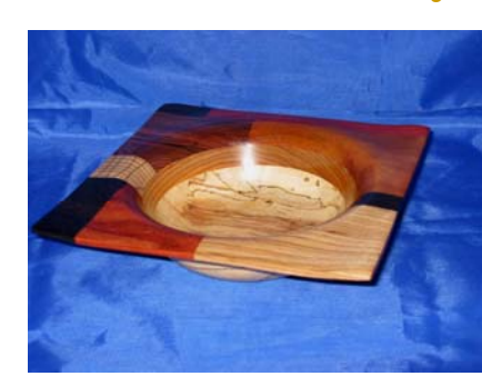
Dick Dlugo Redheart, Ebony, Kingwood, Beli, Ash, Walnut, Square Edge Bowl