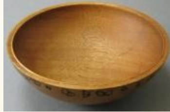
Ken Staggs - Mahogany