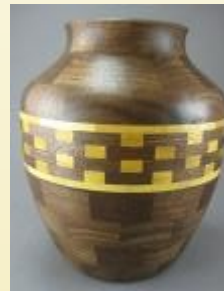
Tom Boejan - Walnut/Yellowheart/Birch