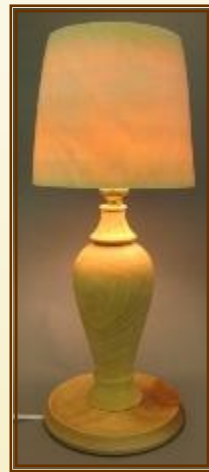
Ken Staggs - Maple