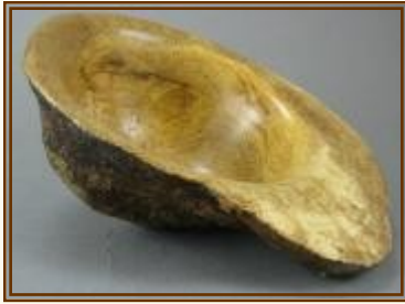
Roger Basrak - Unknown