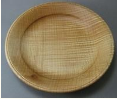
Dawn Herndon-Charles - Tiger Maple