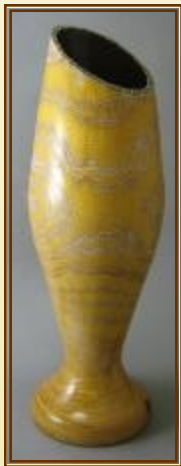
Larry Fabian - Unknown