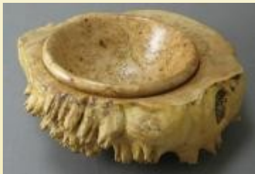
Roger Basrak - Maple