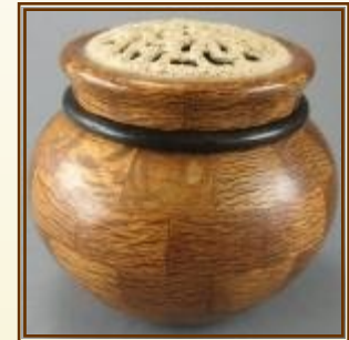
Al Miotke - Wenge/Lacewood