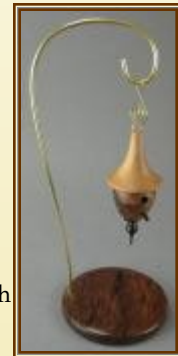
Paul Shotola - Cherry