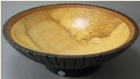
Al Miotke - Unknown