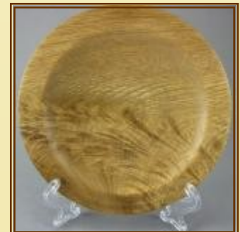
Don Hamm - Oak