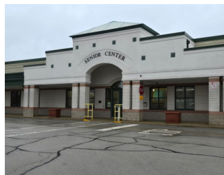
The AH Senior Center entrance