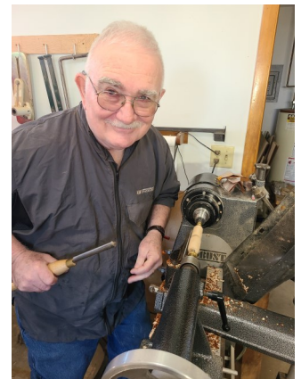
Pages 8 and 16

CWT MEETING Thursday April 11, 2024 6:30 pm to 10 pm Hybrid Meeting! Zoom info on back page.