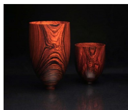
Stuart Batty, Cocobolo bowls